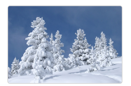
January Library News Dear Parent(s) & Student,

☑ nam02.safelinks.protection.outlook.com